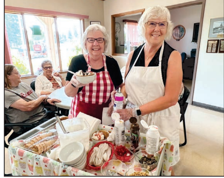
their Summer Barbeque and Picnic.

The afternoon seemed to fly by quickly and before anyone knew it, it was time for the barbecue supper. As always, it was a great meal with a few different kinds of salads, cheese burgers, hot dogs, brown beans, fried onions, and homemade pie and other desserts. The crowd was hungry after playing games outdoors all afternoon, and enjoyed everything on offer. A very special thanks went out to the kitchen staff for organizing such fantastic food all day long. Everything was delicious.