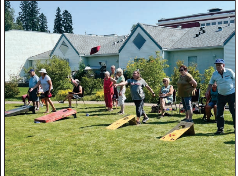
The Pioneer Cabin served up ice cream sundaes on August 16 during Seniors enjoying a beautiful afternoon of games on August 16, during the annual Pioneer Seniors Summer Picnic.