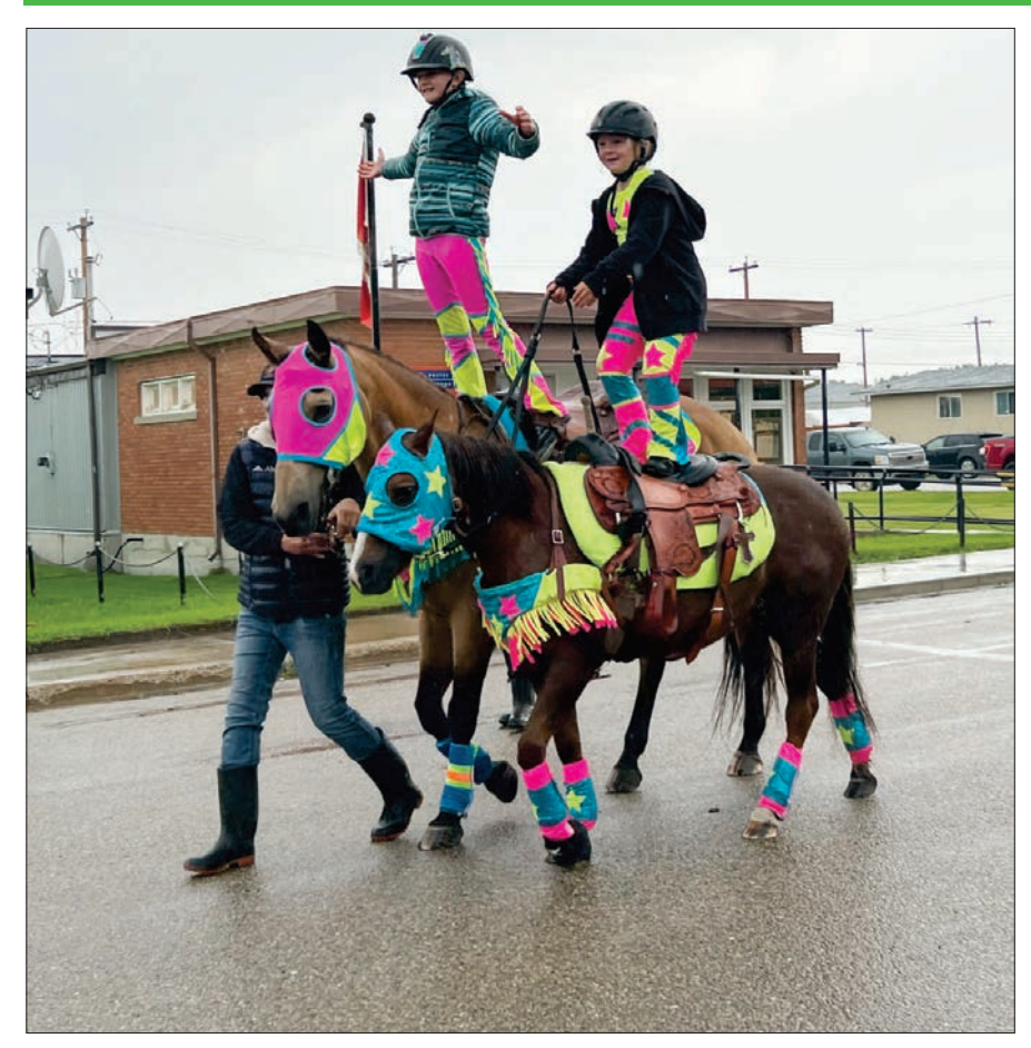
Colourful floats and feats of balance were all part of the parade during the Wildwood Fair.