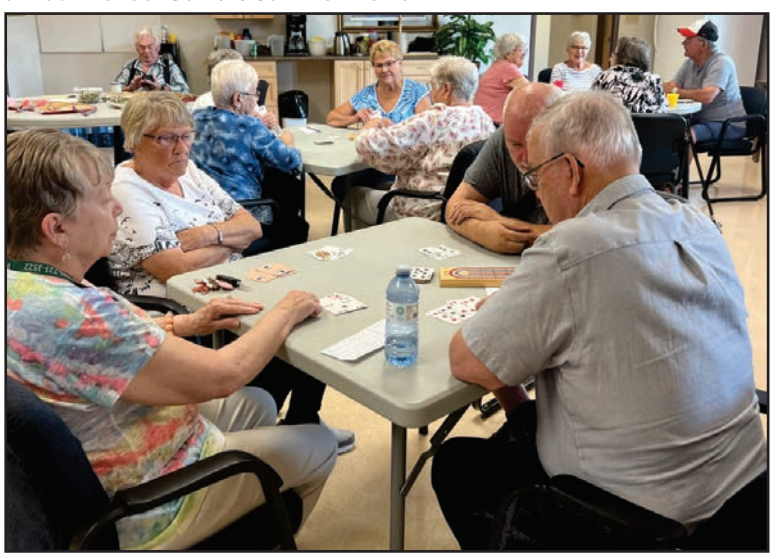
The Pioneer Cabin was filled for their Annual Seniors Summer Pioneer Cabin Held their Annual Summer Picnic on August 16. Seniors were both inside playing cards or outside playing games.