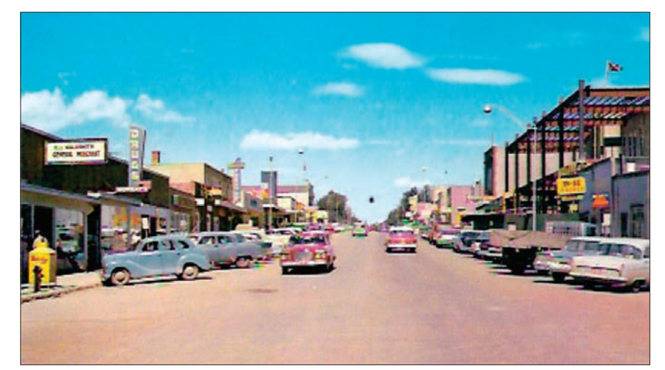
Circa 1948: Edson Town Hall and Edson Public Library.

When social media blocks your access to the news, turn to your local newspaper.