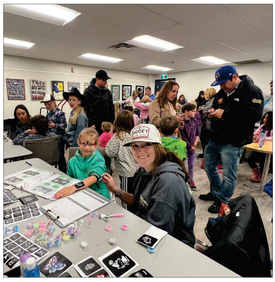
Glitter tattoos and face painting was another popular spot for the youngsters to hang out at the Wildwood Fair on August 18th.