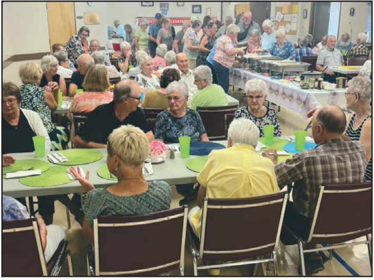
Barbecue that was held on August 16.