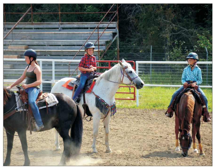
The Horse Show was a popular event at this year's Annual Wildwood Agricultural Fair on August 19.

As soon as the clock struck 12 the kids were diving into the Money Pit Dig. The dig was only one of the many activities available at this year's Wildwood Agricultural Fair on August 19.