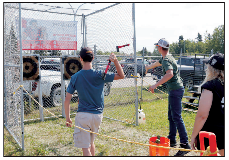
This year's Wildwood Agricultural Fair had activities for all ages, including Axe throwing for the older fair-goers.