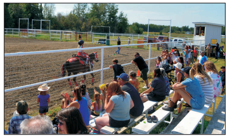
This young rider shows her skill at this year's Wildwood Agricultural Fair on August 19.