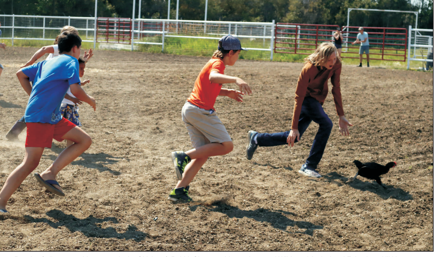
People of all ages could compete in the Chicken & Rabbit Chase at this year's annual Wildwood Agricultural Fair.