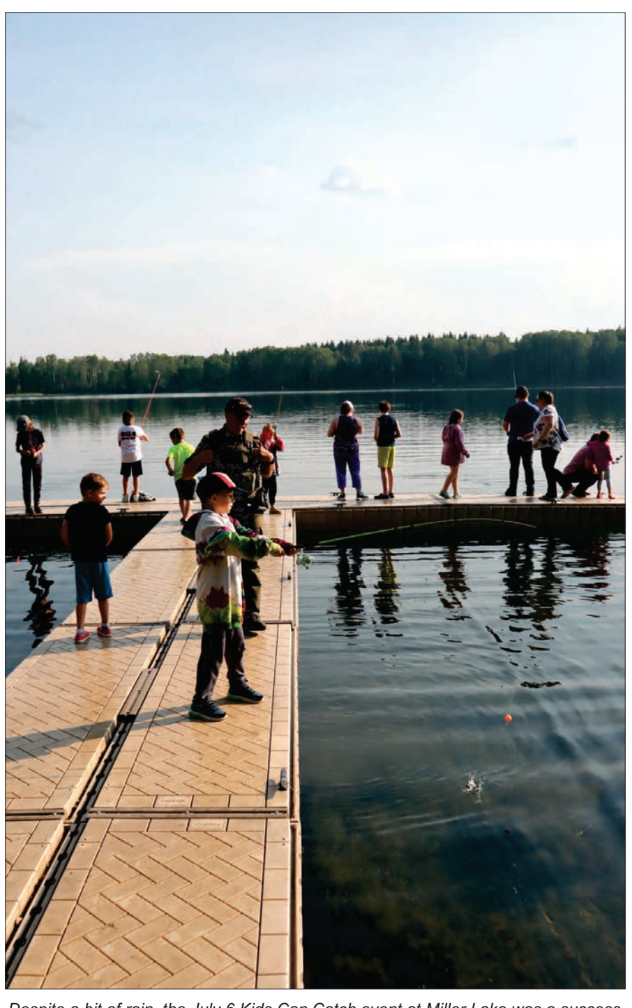
Despite a bit of rain, the July 6 Kids Can Catch event at Miller Lake was a success. Families enjoyed the opportunity to get outside and have some fun.