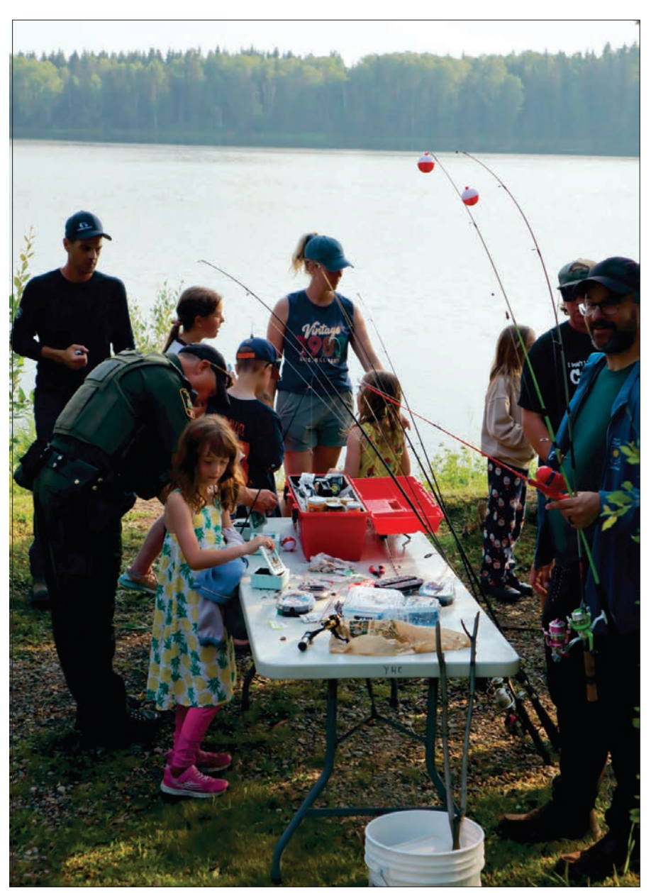
Alberta Fish and Wildlife were on site at the Annual Kids Can Catch Event July 6. Kids could learn about fishing from experts while also enjoying free food and other goodies.