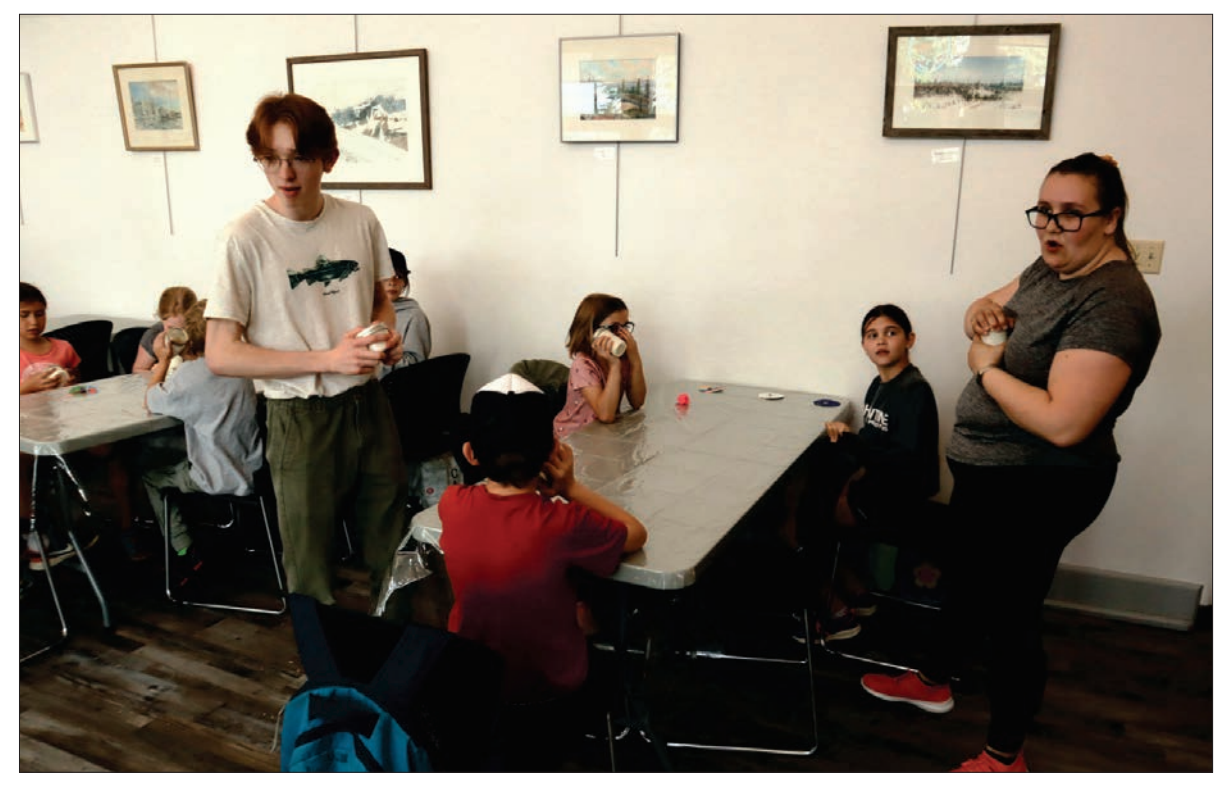
Kids ages 6 to 12 had a great day of fun and learning at the first of the Red Brick Art Centre's Summer Day Camps. On July 5, they kicked off the year with a "Blast from the Past" theme that taught kids all about how things used to be. In this picture, kids got a chance to make their own butter, the old fashion way