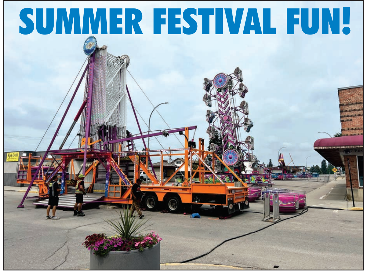
Edson & District Chamber of Commerce Summer Festival began in downtown Edson on July 12, with lots of great deals at local stores, amusement rides, games, food and more. See our July 24 issue for full coverage. Pictured are rides being set up near the CIBC on Main St.