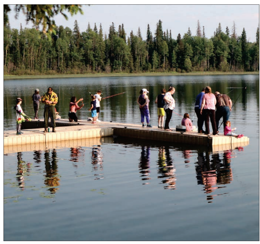
At the Annual Kids Can Catch Event at Millers Lake on July 6, kids could learn how to fish alongside volunteers from Yellowhead County and Alberta Fish and Wildlife.