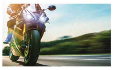
Cycling Alcohol and drug impairment Construction zones Off-highway vehicles New drivers