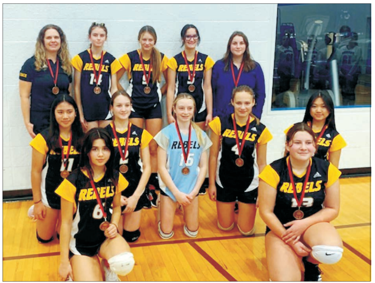
On Tuesday, November 15th, the Holy Redeemer Junior Volleyball teams had a very impressive showing at the annual GYAC Tournament in Edson. The Junior A Girls won the bronze medal after defeating Gerard Redmond from Hinton. Meanwhile the Junior A Boys finished in 4th place out of 8 teams - their playoff games were lost in 3 sets and not by much. With only four returning volleyball players this year there is lots to celebrate. And finally, the Junior B Girls also had an impressive tournament with most of the athletes competing in their first full season of volleyball. Here, the HRH Junior A Girls showcase their bronze meals after a hard fought season. submitted

THE WEEKLY ANCHOR MONDAY, NOVEMBER 28, 2022 PAGE 11