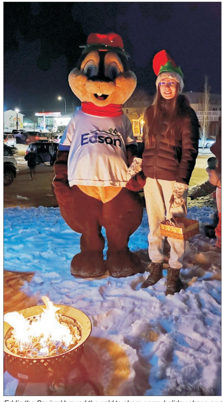
Eddie the Squirrel braved the cold to share some holiday cheer, and candy canes at RCMP Centennial Park during the Light-Up.

EDSON CULTURAL HERITAGE ORGANIZATION AND THE RED BRICK STAFF WOULD LIKE TO