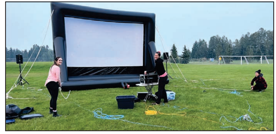
Youth Interagency's Outdoor Movie Night was plagued with technical difficulties that brought an early end to the event.