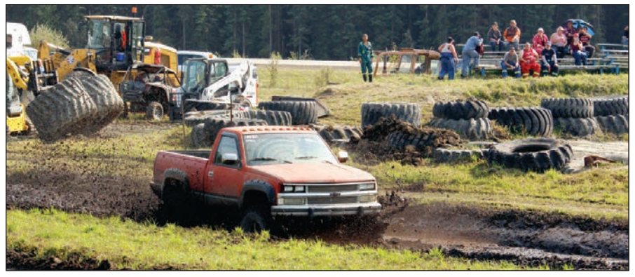
One of the E class heavy duty trucks charges its way through the bog at the annual Hillbilly Demolition Derby and Mud Bog.

The night set out to be very promising with the free movie 'Mean Girls' in