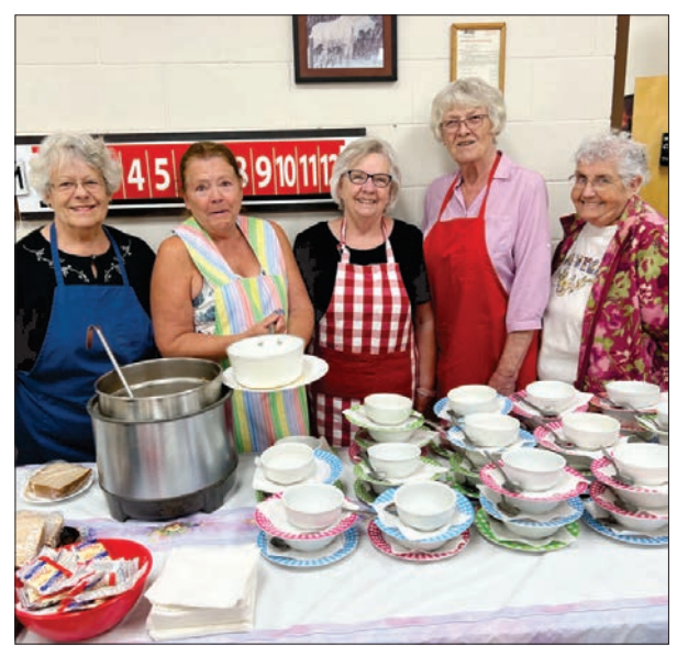
A few of the familiar faces were happy to welcome guests back for soup and sandwiches on September 5, at the Pioneer Cabin.