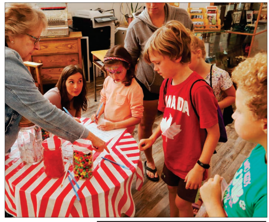
Win or lose, each youth received a prize each time they played a game at the Red Brick's 9th annual Kids Carnival on August 21.