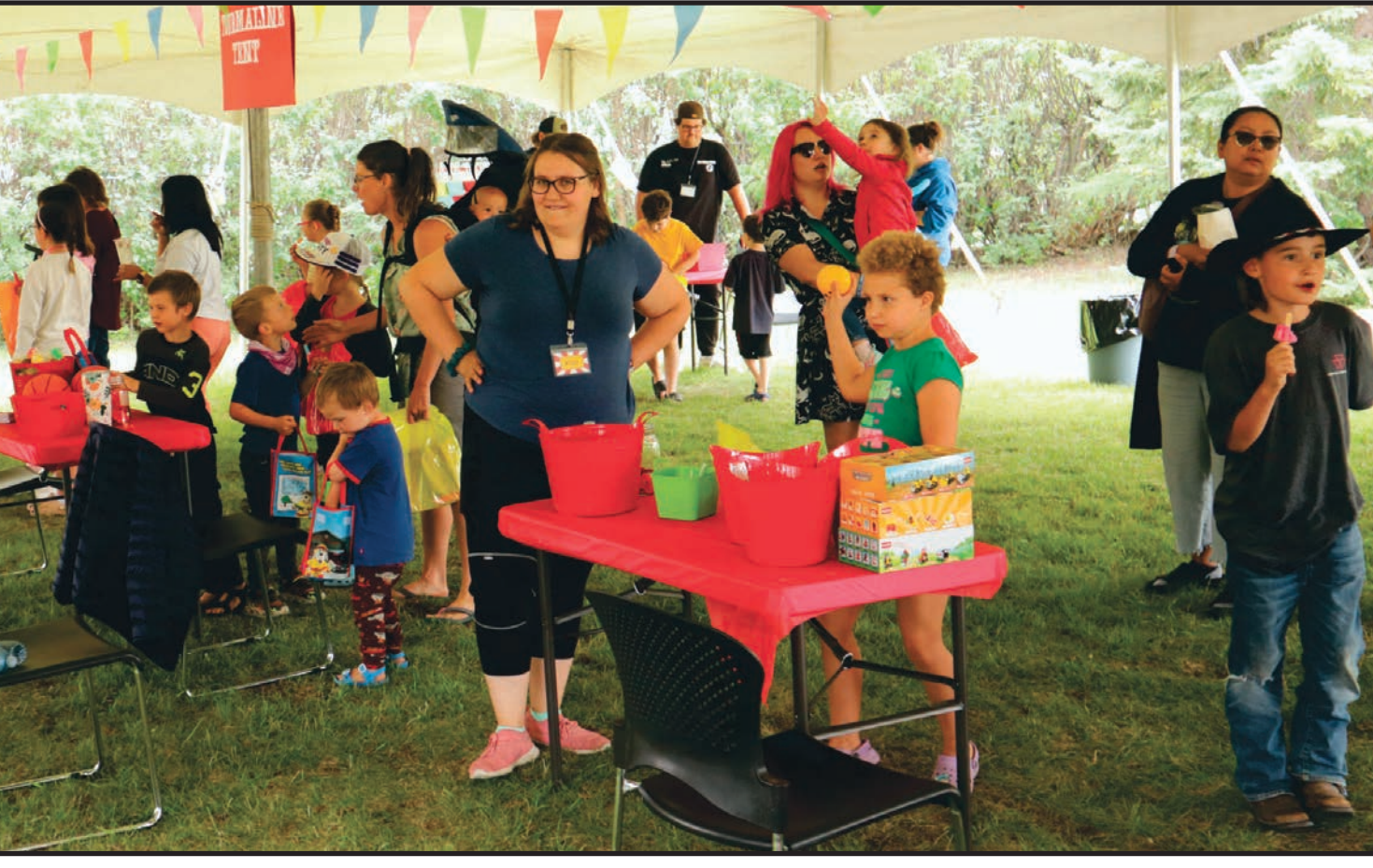
There were seven different classic carnival games for kids to enjoy during the 9th Annual Red Brick Kids Carnival on August 21.