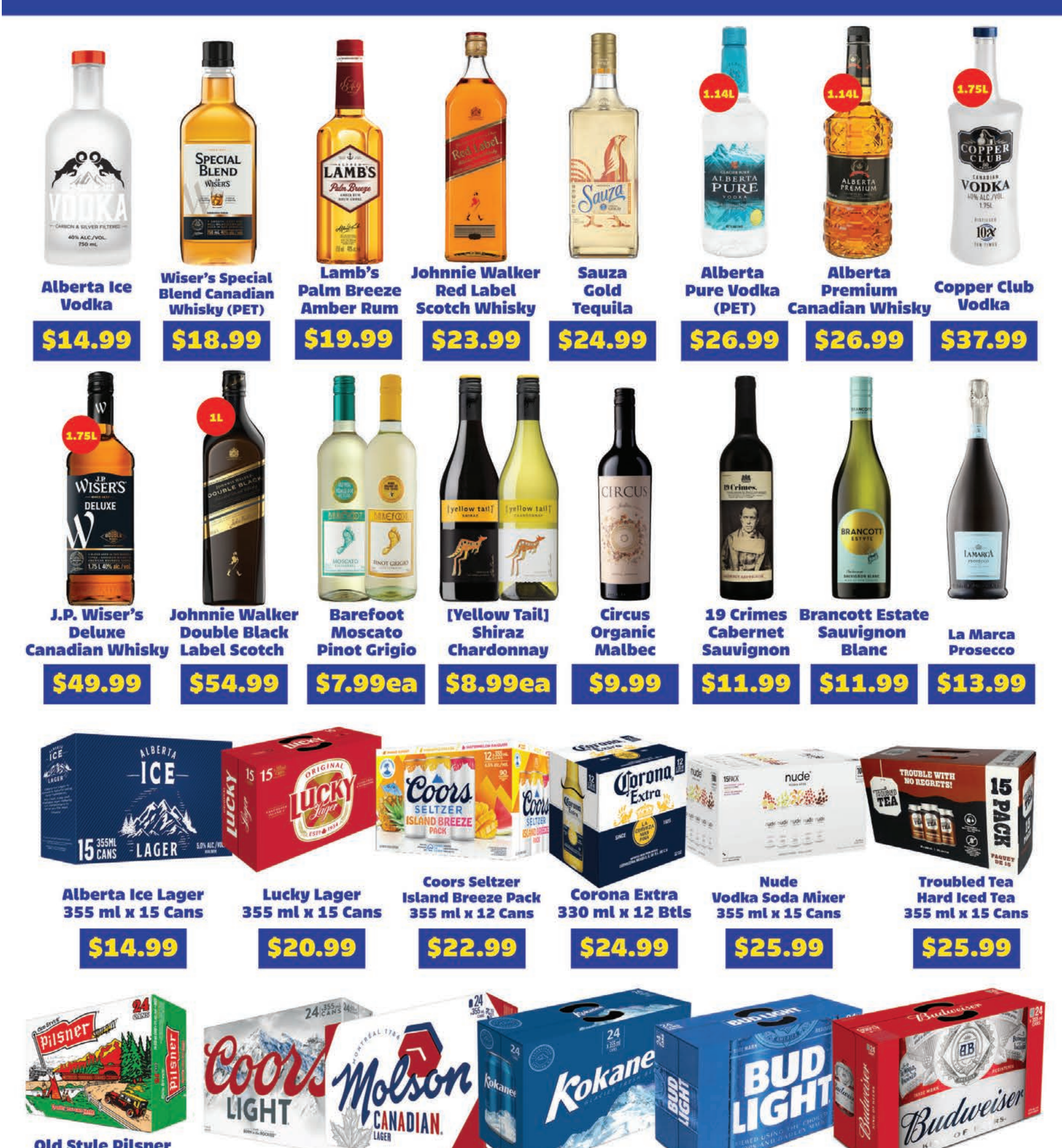
Old Style Pilsner